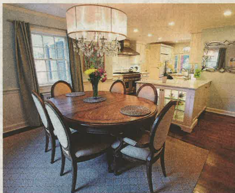
The home, remodeled by Aparna Vijayan of Ulrich Inc., includes a renovated powder room, top, which was expanded with Carrara marble countertops and a marble mosaic floor. In the dining room, above, the original floor was replicated and carried into the kitchen and tied together by a darker finish.